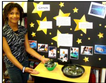
Cherish demonstrates the basics of comets.

“From planes faster than a bullet to planes made of plastic and glue, we learned it all,” summarized Ty.