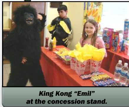
King Kong "Emil" at the concession stand.

1334 L. RON HUBBARD WAY LOS ANGELES, CA 90027 TEL (323) 660-8732 FAX (323) 663-2013